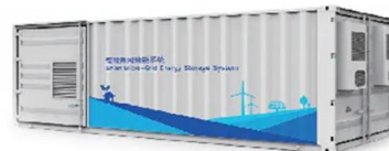
Lion Storage has received a construction permit for a 347MW/1,457MW BESS project while Giga Storage...